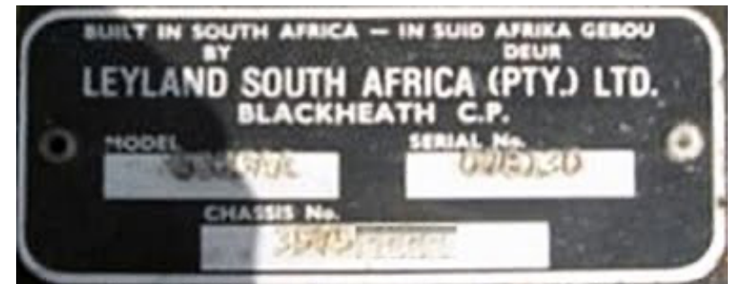
From late 1970's a South African CKD Range Rover from Blackheath C.P.