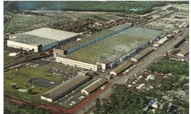
BLMC Blackheath plant, Cape Province, South Africa in 1972 with RRC CKD

Range Rover 1970 Range Rover 1971 Range Rover 1972 Range Rover 1973 Range Rover 1974 Range Rover 1975 Range Rover 1976 Range Rover 1977 Range Rover 1978 Range Rover 1979 Range Rover 1980 Range Rover 1981 Range Rover 1982 Range Rover 1983 Range Rover 1984 Range Rover 1985 Range Rover 1986 Range Rover 1987 Range Rover 1988 Range Rover 1989 Range Rover 1990